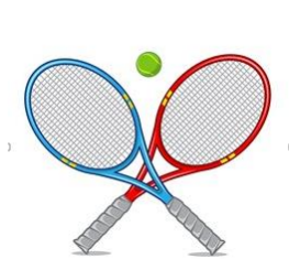
Tennis at Wimbledon