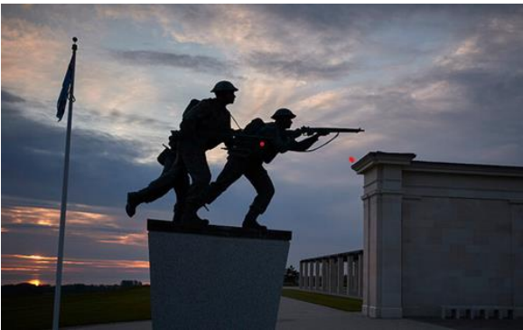
80 th Anniversary of D Day landings