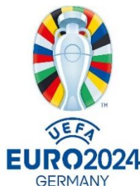
Euro 2024 Football Championships