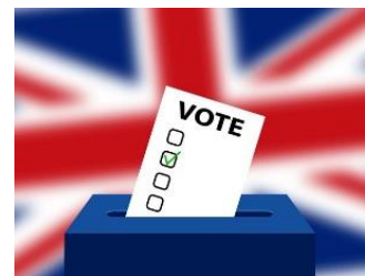
And don't forget the coming General Election