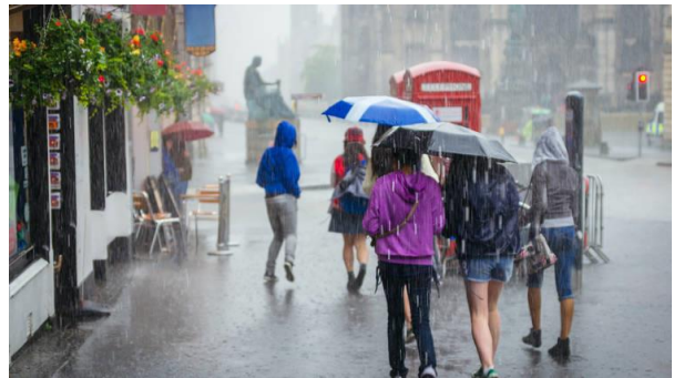
The Great British Summer (again!)